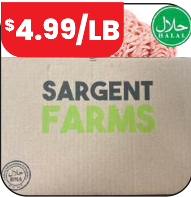
Top Quality Fresh Ground Chicken