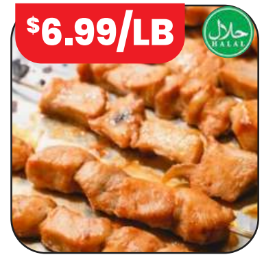
Marinate Peri Peri Chicken Boneless