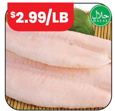
Top Quality Fish