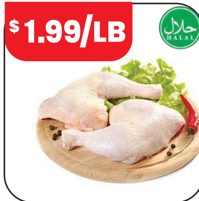
Fresh Chicken Leg (as is)