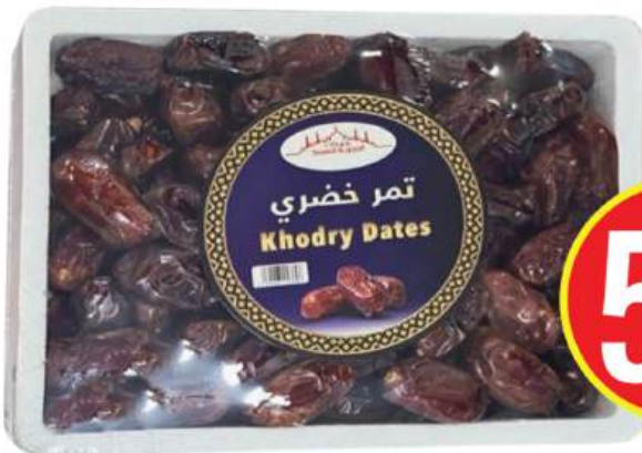
KHODRY DATES 1KG