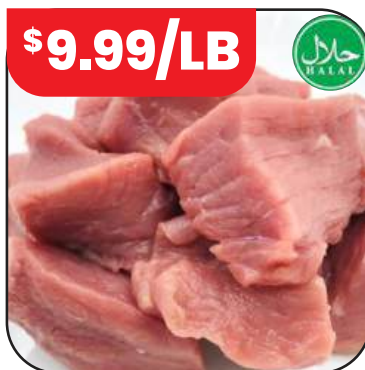
Fresh Veal Boneless