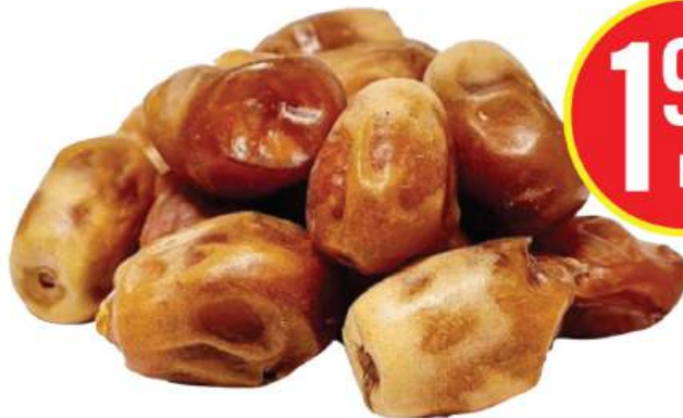
IRANI NATURAL DATES