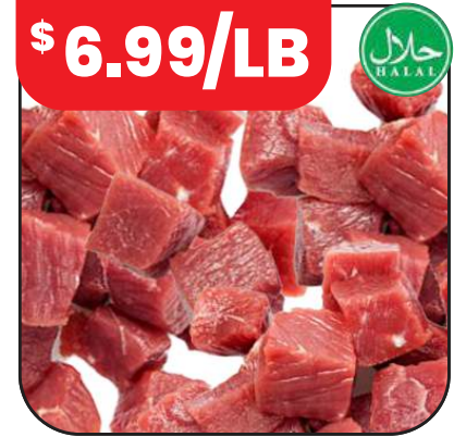
Ontario Fresh Beef Cubes