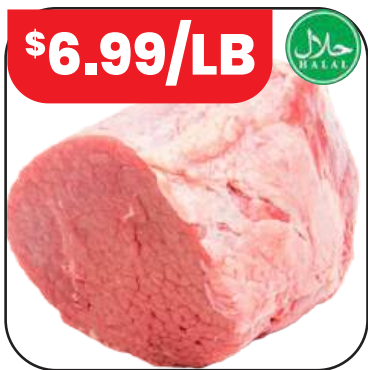
Ontario Fresh Eye of Round Roast