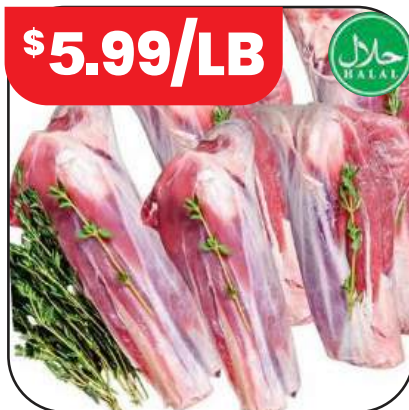
Frozen Lamb Shank