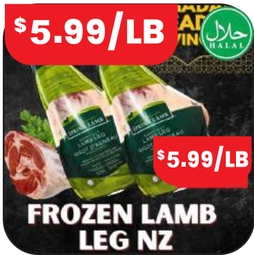
Frozen Lamb Leg nz as is