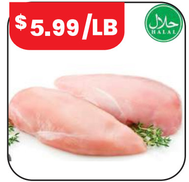
Fresh Chicken Breast Boneless as is