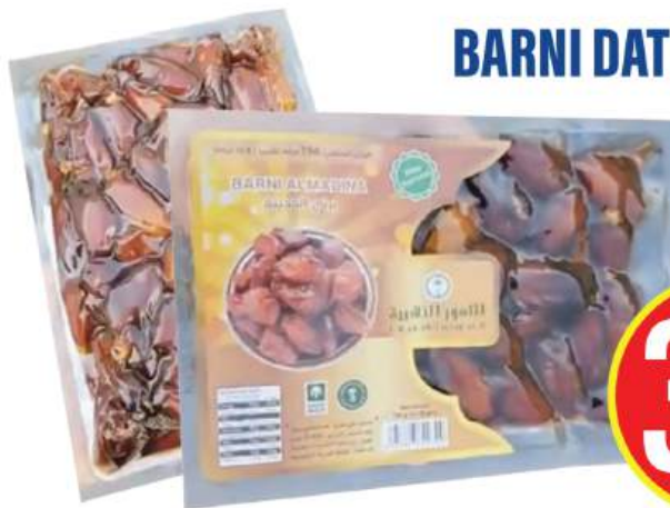
BARNI DATES 1KG