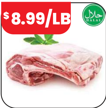
Ontario Fresh Lamb Shoulder