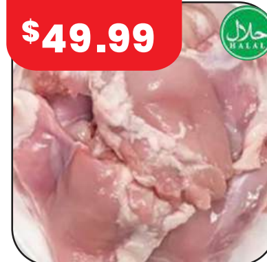
Chicken Thigh Boneless Bag as is 10LB