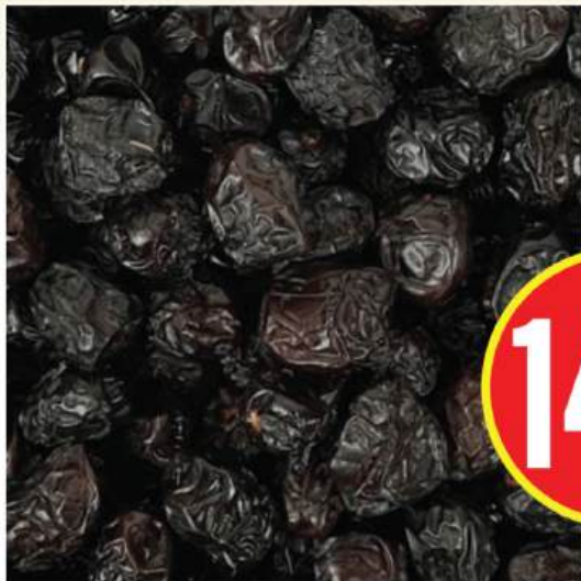
AJWA DATES 1KG