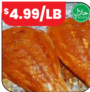
Top Quality Marinate Boneless Fish