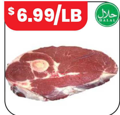
Top Quality Ontario Fresh Veal Shoulder Slice