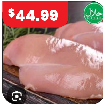
Chicken Breast without skin as is 10lb