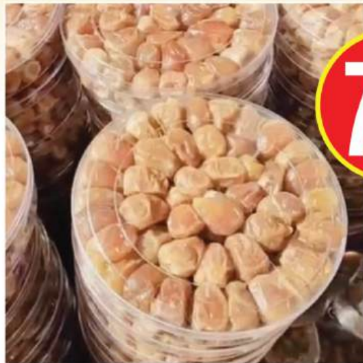
SUKARY DATES 1KG