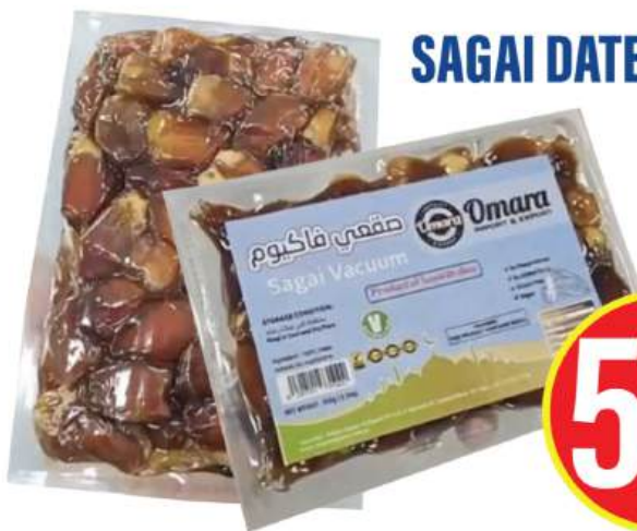
SAGAI DATES 1KG