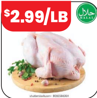
Whole Chicken (as is)