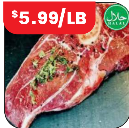
Beef Shoulder with Bone