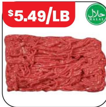
Top Quality Medium Ground Beef