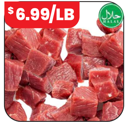
Ontario Fresh Beef Cubes