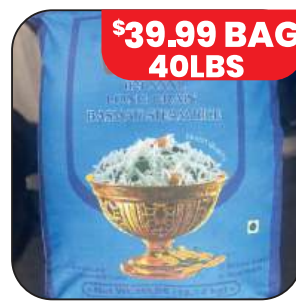
AAA XXXL 1121 Basmati Rice