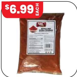
Red Chilli Powder Extra Hot 800g