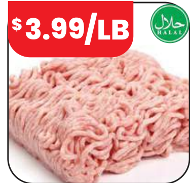
Top Quality Fresh Ground Chicken