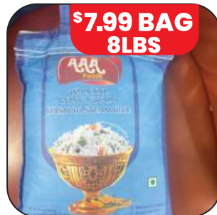
AAA XXXL 1121 Basmati Rice