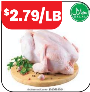
Whole Chicken (as is)