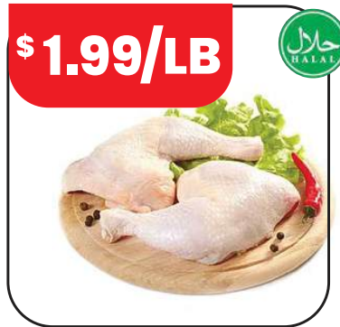
Fresh Chicken Leg (as is)