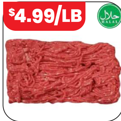
Top Quality Medium Ground Beef Limit 10lb per Family