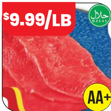
Top Quality Beef Cutlet