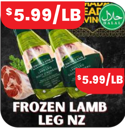
Frozen Lamb Leg nz as is