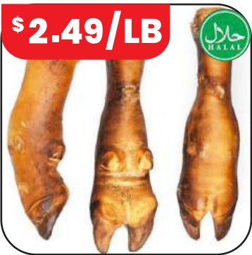
Top Quality Cow Feet Burn