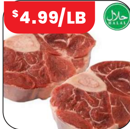
Beef Shank as is