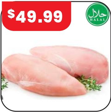
Fresh Chicken Breast Boneless as is 10lb