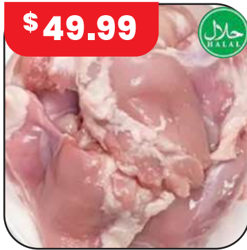
Chicken Thigh Boneless Bag as is 10LB