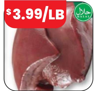
Fresh Beef Liver