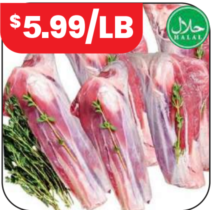
Frozen Lamb Shank