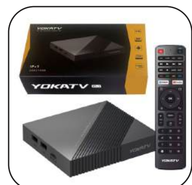
Get 4K IPTV Box FREE with a 2-year subscription recharge.