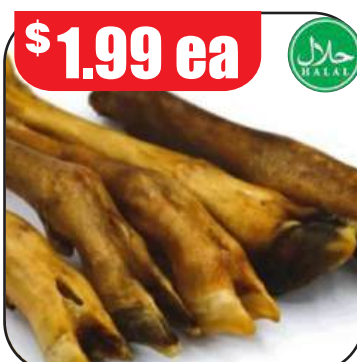
Top Quality Lam and Goat Feet