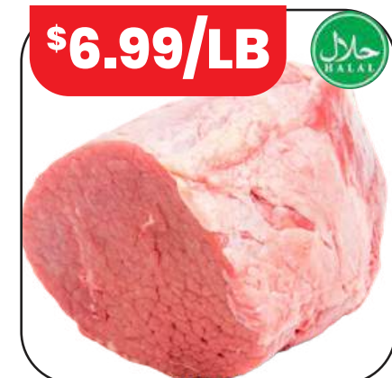
Ontario Fresh Eye of Round Roast