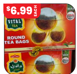
Vital Tea 216 Tea Bags