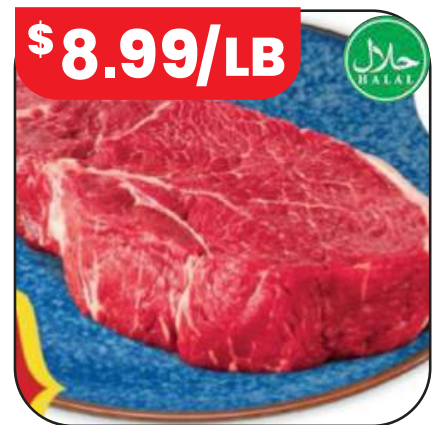
Top Quality Ontario Beef Brisket Point Steak